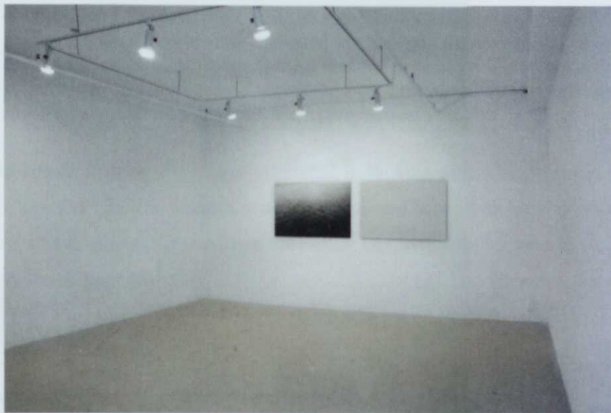
Figure 3.3 Périphérique , (installation view Galerie B-312) each 30" x 40", 2011

from their not being apprehended by the senses." 44 When we look through a camera, the world is not framed into a perfected or necessarily interesting view. The artist's embodied subjectivity is as necessary as the object "out there." This makes me wonder, what is between the visual and the tactile?