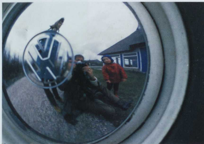
Figure 3.1 Family slide, circa 1970.

I read this caption on an old slide box full of family slides. It refers to how certain snapshots (or slides) often get put away in a box, a photo album, or a variety of other storage devices; very few are placed where they will be seen. Sometimes I think images are just too overwhelming to have around. They can cause a disruption or a sort of visual chaos. They sit, waiting in our attics or basements or drawers, for someone to re-collect them. Are these pictures filled with presence or absence? Kierkegaard called repetition and recollection the same movement only in different directions. He says repetition is recollected forward; recollection is repeated backward; they move in opposite directions. He also says that repetition makes a person happy – it has the blissful security of the moment (whereas