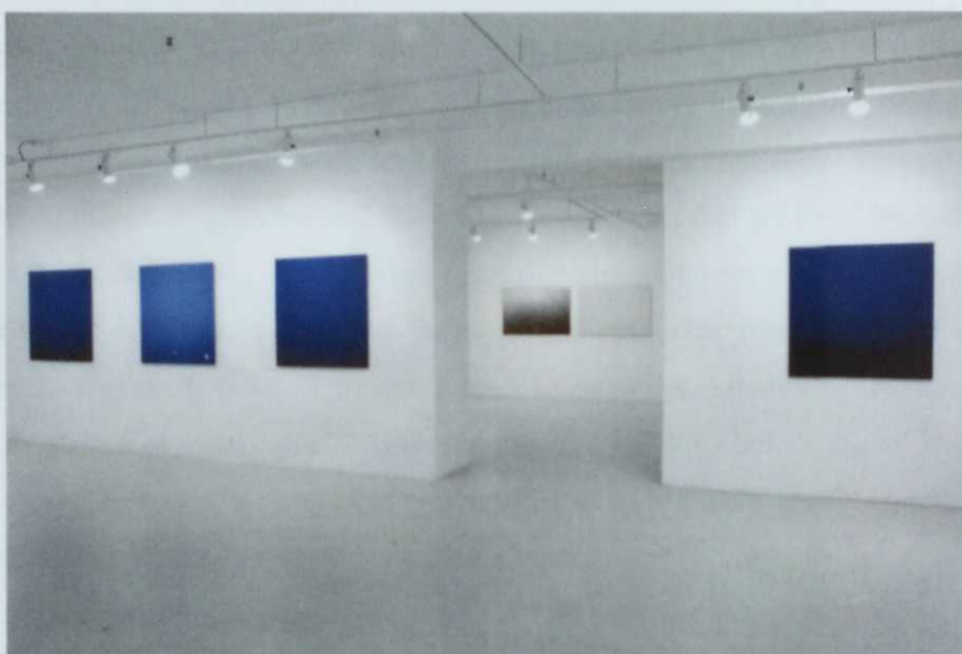
Figure 3.4 Peripheries , (installation view Galerie B-312), 2011

there that I had been avoiding. Imperfections always arise in photography and stand out against its technical virtuosity. Letting them in discreetly is a different game of chance, one that exposes failure and vulnerability as its subject. I consider these elements of loss as positive, as a way to work with a medium's strengths and failures without assuming what is and what isn't. Photography is the ideal medium to do this with because it itself can be chosen based on its affective value against the assertions of any subject matter that are put forward.