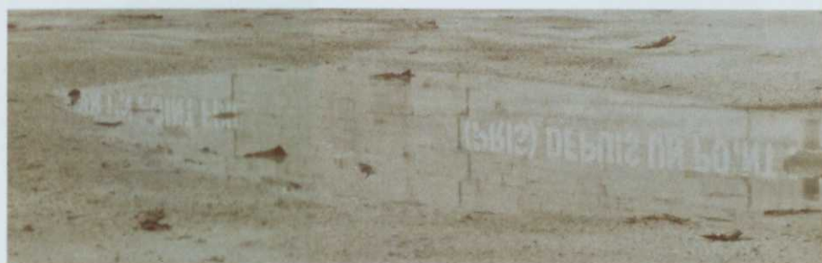
Figure 2.1 untitled , 4"x10", 2011

The lived world can only be discovered through living, and through photography the act of living involves attempts to see or re-see what is there and to reflect on “how it is?” – to see it again.