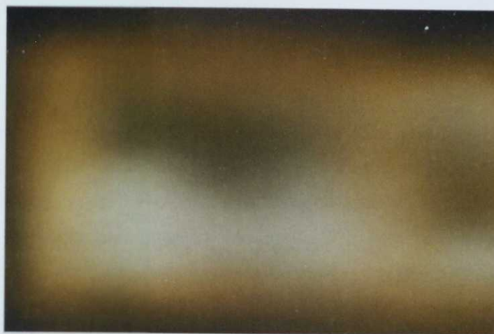
Figure 1.1 untitled , 20" x 30", 2011

other, given prominence, put under pressure, selected and restricted to a frame." 12 These two points – the loss (death) of the subject and the photograph's inherent abstract qualities – have been crucial to reflecting on my own work, which plays with opacity (the disruption of transparency), vagueness and ambiguity. Overall I am attracted to ways of emptying things out, clearing the field so to speak, using the camera and the photograph as a way to explore displacements that can occur in the space between here and there. Yet, any fracture is not definitive, there is always (sometimes more, sometimes less) a trace or a connection to the referent. It is this space of the referent, somewhere between showing all, and showing nothing, that intrigues me, the relation between the particular experience and the universal or fully explicit one.