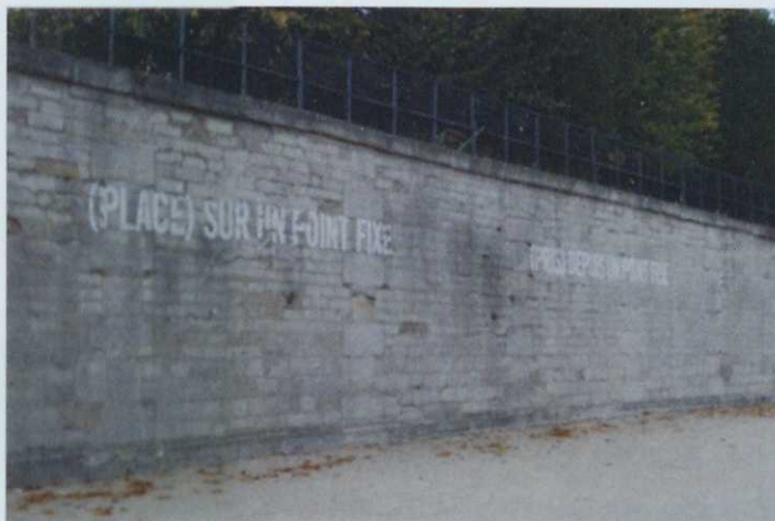
Figure 2.2 Laurence Weiner, “(Put) on a fixed point, (Taken) from a fixed point”, (2000).