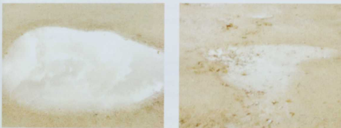
Figure 3.2 Untitled , diptych, 20" x 30" each, 2011.

A way to look at these questions is to use Barthes' vocabulary that he developed to get at a photograph's essence or what he called noeme (which I mentioned earlier in this text). Barthes said he wanted to "attempt to account for the fundamental roles of subjectivity and emotion in the experience of and accounting for photography". 42 Barthes concluded his text Camera Lucida with what he calls the "the two ways of the photograph," the duality of the punctum and the studium . The studium , at its most basic, is what is obvious to everyone, it is coded meaning which comes easily and at a glance. It is what is ordered and comprehensible. I think of this as what is stable and fixed. Whereas the punctum is the less rational side of things, thought of as the private and subjective meaning. It is the emotional, experiential part of looking at an image. The punctum is not communicated through using language and is thought of as that which attacks (wounds) and attracts the viewer. If I fit my questions/reflections of photographic loss into these dualities, then I would say that what I am calling losses are given expression at the level of punctum , and on the other end, the preserved subject or document is in the territory of the studium .