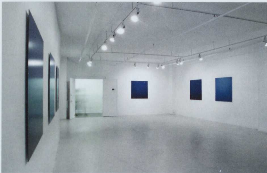
Figure 1.5 Horizon 1 to 11 (installation view Galerie B-312), each 40" x 40", 2011.