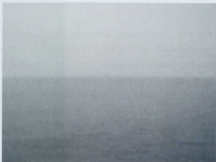
Figure 1.3 Untitled , 20"x 30", 2009

The untitled image above (Fig. 1.3, untitled , 2009) was taken through a window, showing the residual material on its glass (or frame). In the photograph this residue sits on what appears to be the surface, and is flattening into the horizon, shifting the focus back and forth between the drops of rain, the dirt, and the reflections on the glass surface. The focus moves back and forth between these layers that we see through and into (the camera lens and the window) but which also form a barrier in terms of opacity. Finally the eye might focus on the surface detritus and the seascape blends into it.