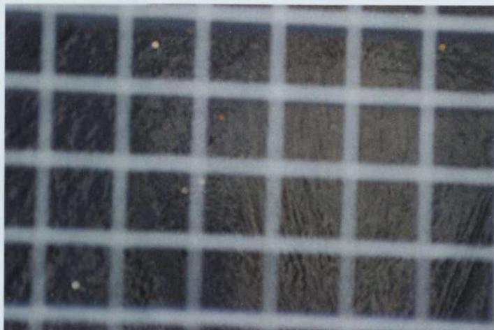
Figure 1.2 Image from series Grid , 20"x 30", 2011

Images from the series Grid 1- 11 (2011) (Fig. 1.2) also draw attention to their surface, especially by the contrast of depth and layering. The main subjects – the grid, the water underneath, and the pennies in the water – are flattened together in the way that only a camera (or a lack of depth perception) would show. This compression is an aspect of abstraction. I am attracted to the contrast between the flowing water and the fixed metal grid, and distance that is lost (through flattening) and that we are reminded of by the pennies that lay on underwater. In the final work these elements are emphasized through repetition; there are four photographs in the series.