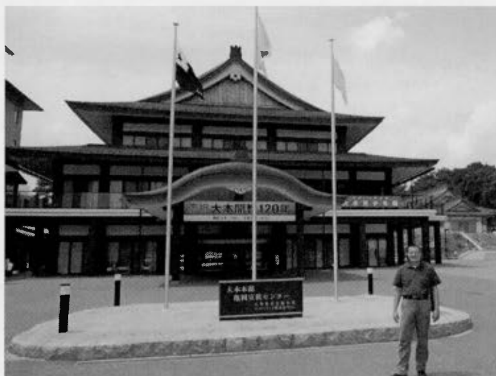
Entrance to the main building in Kameoka, with three flags flying: (left to right) Esperanto, Oomoto and Jinrui Aizenkai