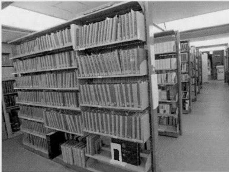
Library and archives at Kameoka Oomoto Center