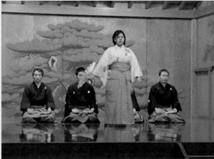
Presentation of Noh drama at the Kameoka Oomoto Center