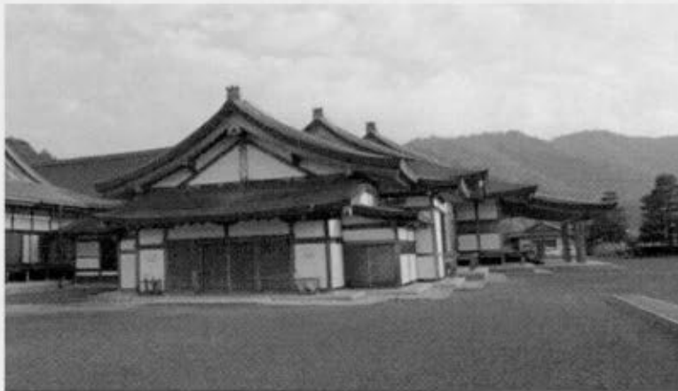
Choseiden, the main Oomoto temple in Ayabe