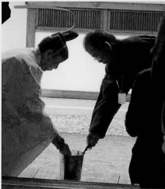
Oomoto priest (left) assists with Tao Yuan ritual (Tao Yuan representative on the right). Tao Yuan is Oomoto's oldest interfaith partner