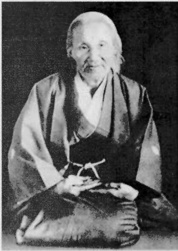
Deguchi Nao