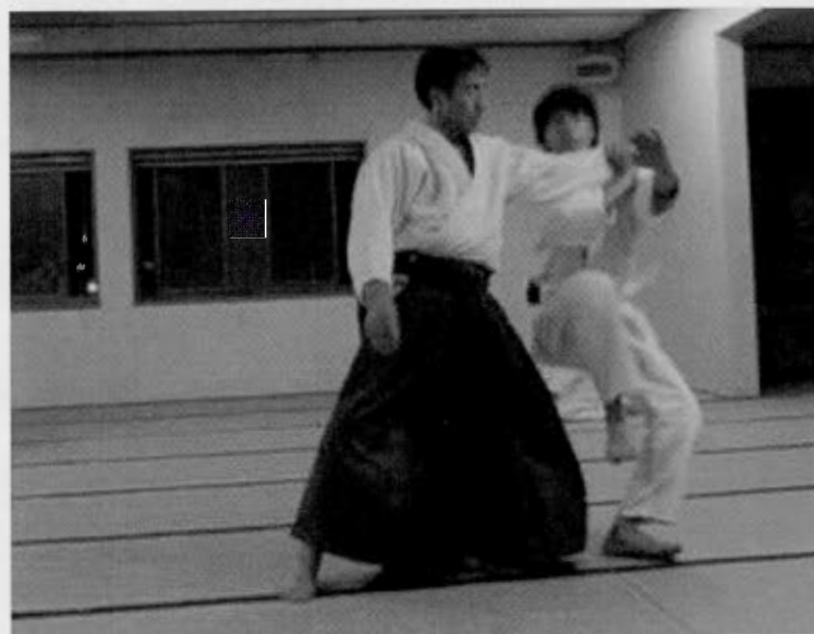
Aikido training session at the Kameoka Oomoto Center