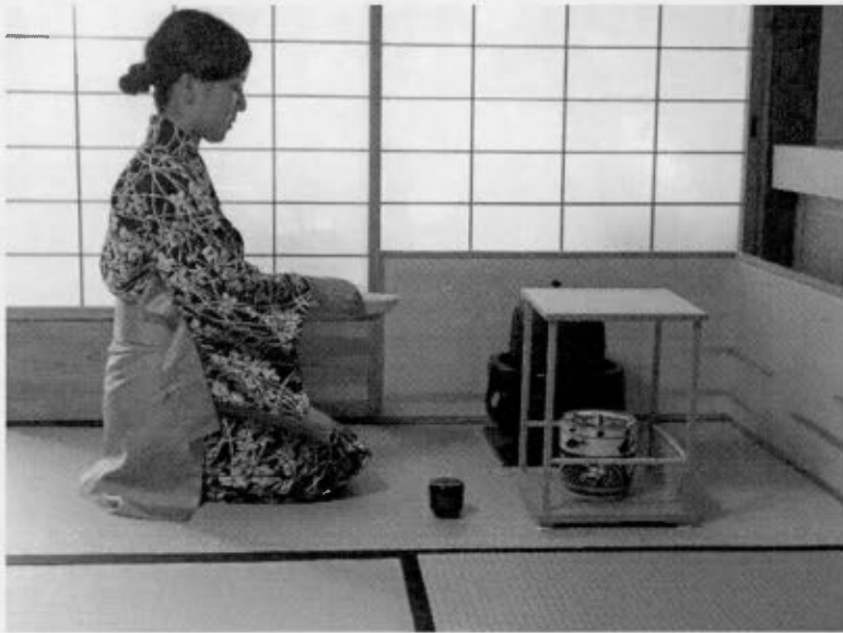
Tea ceremony study at the Kameoka Oomoto Center