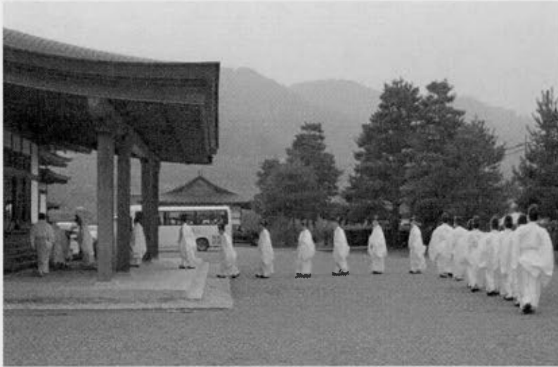
The Autumn Grand Festival, procession