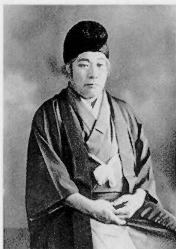
Deguchi Onisaburo