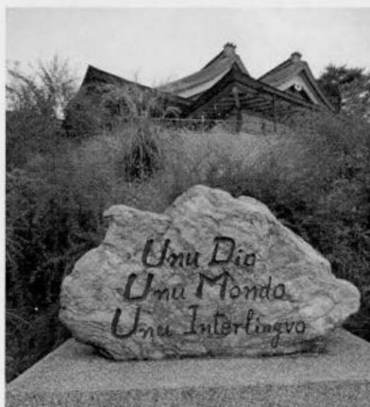
“One God, One World, One Interlanguage” monument