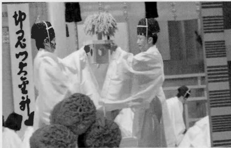
The Autumn Grand Festival: presentation of offerings