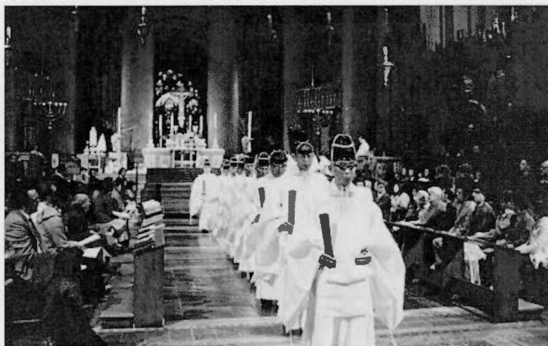
Oomoto liturgy in the Cathedral of St. John the Divine in New York (1982)