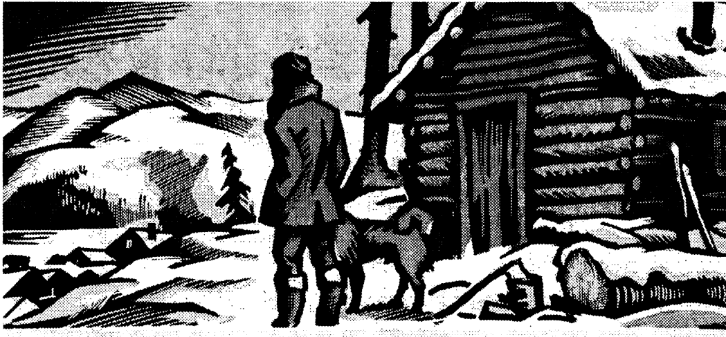
FIGURE 1: illustration by André Collot, in Louis-Frédéric Rouquette, Le grand silence blanc (Paris: Éditions Arc-en-ciel, 1942), p. 32.

Oslo, has harsh winters and is located at the southernmost limit of the polar region. Paradoxically, the continental climate and the cold current from Labrador, which runs down the gulf and estuary of the St. Lawrence, make Quebec the only place where the Arctic reaches such low latitudes. 8 Thus, Quebec is the place where the North extends the farthest south.