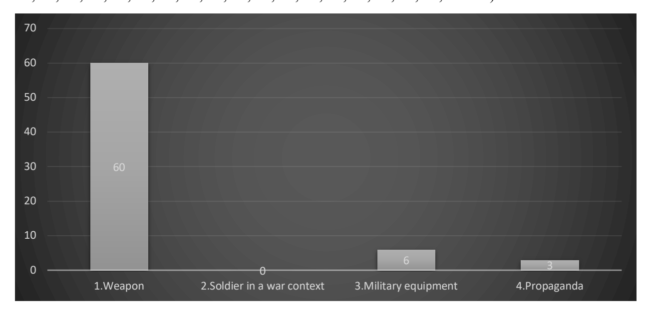
Figure 3: Distribution of warlike images in the first grade mathematics textbooks.

There is also a semiotic integration of the concept of jihad via frequent, militarized images of weapons, assault rifles, airplanes, guns and revolvers, and tanks and rockets, (e.g., MAMATH 1:11, 14, 15, 16, 18, 19, 21, 22, 34, 35, 36, 55, 57, 58, 59, 65, 66, 67, 68, and 69).