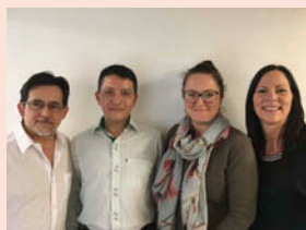
REAC-TBI Clinical Research Laboratory

Abstract: Evidence-based neurorehabilitation must be informed by the values, expectations, and goals of individuals with acquired brain injury (ABI). The Client's Intervention Priorities (CIP)© is a person-centered tool for defining rehabilitation priorities according to self-perceived functioning. The use of the CIP tool is encouraged to promote self-determination and optimal involvement of individuals with ABI in interdisciplinary neurorehabilitation. The objective of this study was to determine the reliability (internal consistency, temporal stability) and content validity (expert agreement) of the CIP tool. Thirty individuals with ABI (66.7% with traumatic brain injury, 33.3% with stroke) with a mean age of 44.8 (SD = 12.6) years were administered the CIP twice at a test-retest interval of 2.3 (SD = 0.7) weeks. An expert panel of 17 neurorehabilitation clinicians and researchers participated in the validation. The CIP tool showed excellent (total score \alpha = .90 ) and good (CIP subscales \alpha = .83-.87 ) internal consistencies, with excellent temporal stability (intraclass correlation coefficients = .78-.90). Experts agreed that the CIP items reflect the Disability Creation Process model (89.4% scored as having high to very high correspondence) and were comprehensibly stated (98% rated as clear to